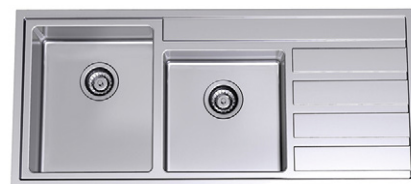
PETE EVANS SINK